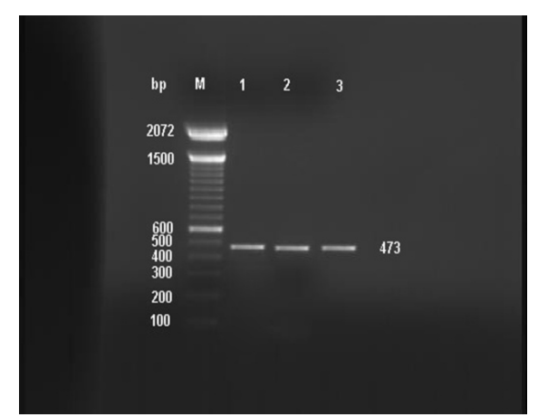
Fig. (1): RT-PCR detection of BEFV, 473bp amplified product of G2 gene for different strains. Lane M: DNA ladder of 100 bp, Lane 1: Reference BEFV strain, Lane 2: BEFV Buffalo isolate, Lane 3: BEFV Cattle isolate.

The expected size of PCR product as 473 bp of the G2 protein encoding gene of BEFV was successfully detected in 17 out of 20 (85%) samples from cattle and 9 out of 20 (45%) samples from buffaloes (table2). The size of the resulted fragments were analyzed by gel documentation system and showed that the BEF virus reference strain and the cattle and buffalo isolates had the same size of G2 gene fragment without significant differences between the strains as represented in (fig.1).